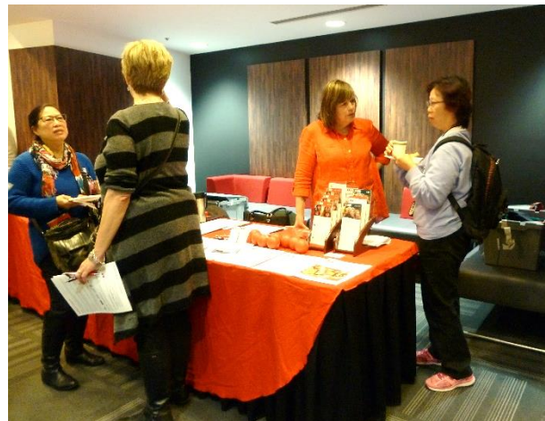
Information Table at an ACT Event

While these events teach skills and demonstrate practical applications on how to support individuals with autism, the topics and learning outcomes are often applicable and useful to the greater special needs population. ACT offers group discounts to encourage intervention teams and colleagues to come together and reinforce the learning and implementation after the event. Everyone is welcome and while events are priced as low as ACT can manage, ACT provides bursaries to participants who must travel, or are under financial stress - regardless of diagnosis.